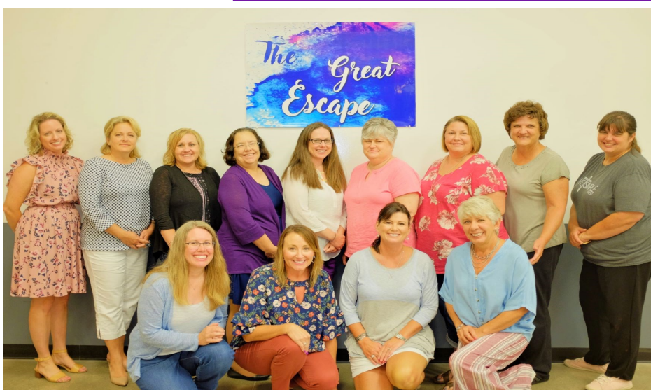
1st Annual Southern Instructor Assembly held August 2, 2019

August 2, 2019 SIU Nurse Aide Testing held its 1st Annual Instructor Assembly in Carbondale. The Assembly provided an opportunity to meet and mingle with fellow instructors, participate in The Great Escape, an educational escape room geared toward nursing assistant students, and share an idea used for learning. The next Great Escape will be held in conjunction with the Northern CNAEA meeting on Friday, February 7, 2020 at William Rainey Harper College in Palatine. Plans are in the works to hold an Assembly in conjunction with the Central Region meeting. Stay tuned for more information.